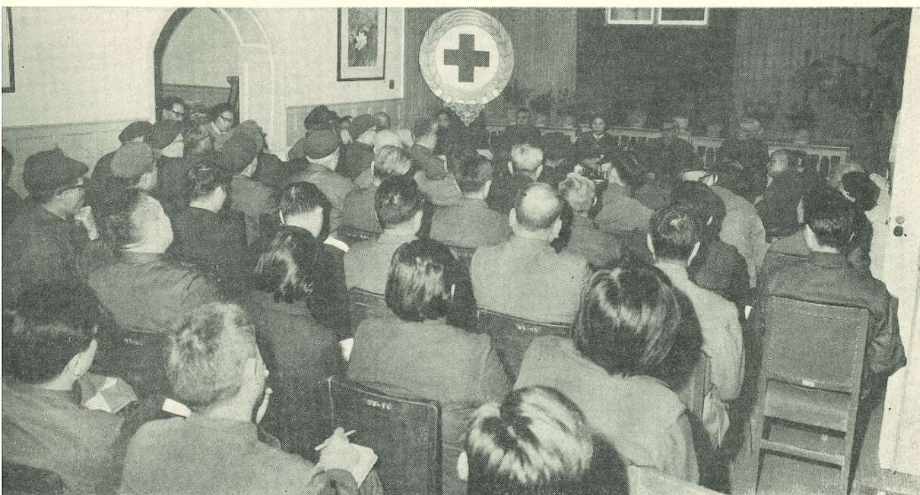
The 3rd Chinese Red Cross National Conference in 1979